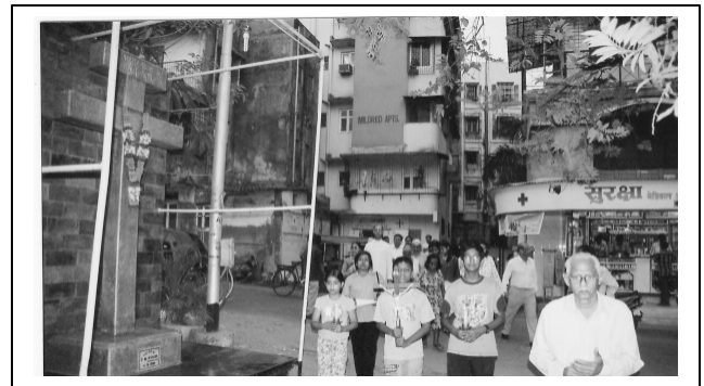
CHERAI ZONE – WAY OF THE CROSS IN THE NEIGHBOURHOOD.