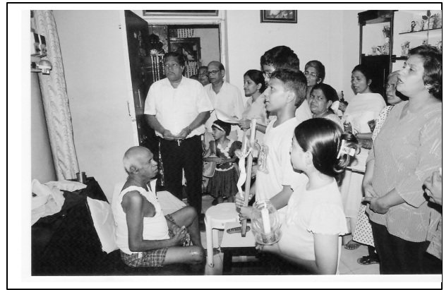
PRAYING WAY OF THE CROSS FOR THE HOMEBOUND