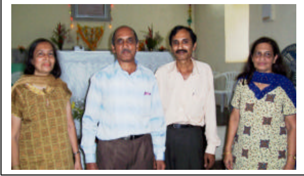
Ghormal Church dedicated Committee