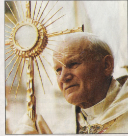
The Eucharist: source and summit of Church life, mission

One of the traditional devotions we have all over is the 13 hours adoration of the Lord in the Blessed Sacrament. One day in a year is set aside in the parish life for the exposition of the Blessed Sacrament on a pedestal on altar for parishioners turns during and spend an hour in prayer before Eucharist.