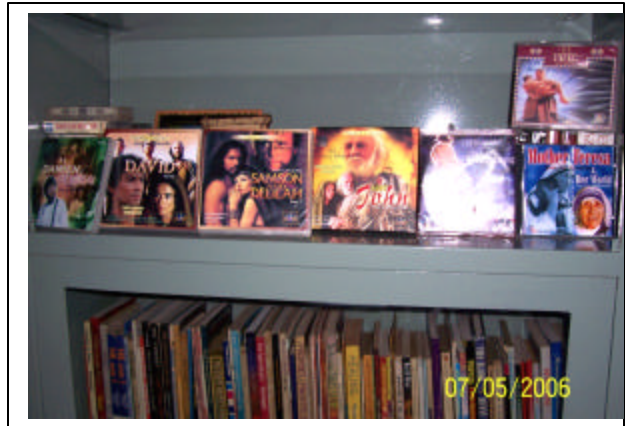
Good News to all Bible lovers