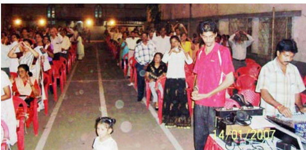
ASSOCIATIONS RALLY 14-01-07