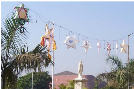
CHRISTMAS STAR CONTEST 2006